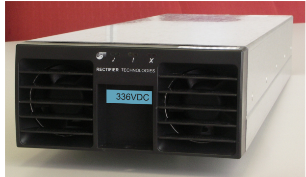
RT18 400V 20A 8kW HRE Rectifier

network connectivity and advanced rectifier sleep mode functionality for additional power savings.