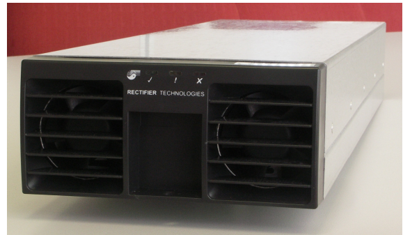
RT18 240V 30A 8.64kW HRE Rectifier

network connectivity and advanced rectifier sleep mode functionality for additional power savings.